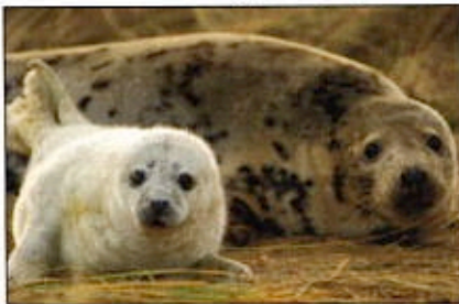
Seal Spotting Boat Trip from Blakeney