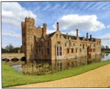
Moated Oxburgh Hall (NT)