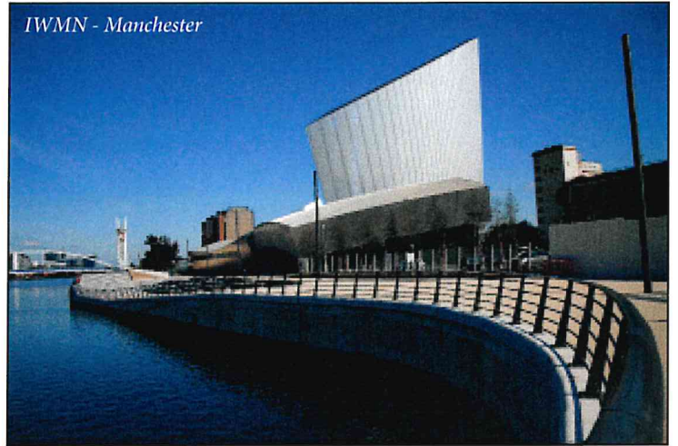
IWMN - Manchester

Friday 21st April - Leaving the hotel after a leisurely breakfast the coach drives to the National Trust's Packwood House , a much restored Tudor House that has been described as Jacobian meets Edwardian. Packwood also boasts some delightful gardens including a collection of ancient Yew trees. From here the coach will head home and the anticipated time of back in Ashford is around 18.00. allowing for a comfort stop.