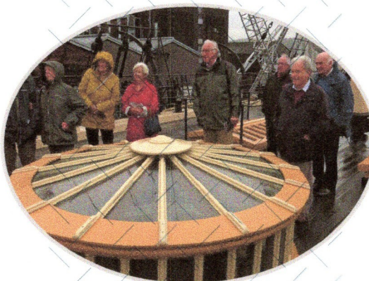
SS Great Britain, Bristol