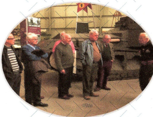
Visit to the Tank Museum, Bovington

Please send completed form to the Secretary