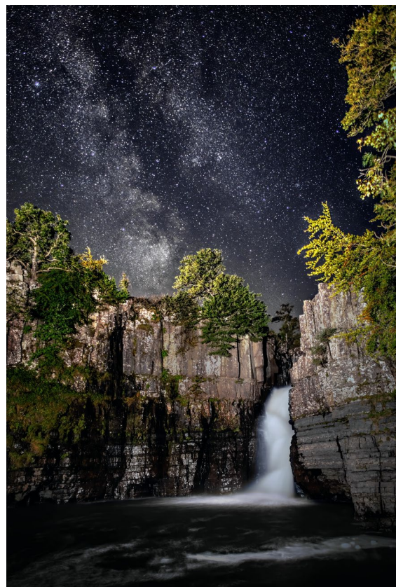
The Milky Way

"You can't just ask customers what they want and then try to give that to them. By the time you get it built, they'll want something new."