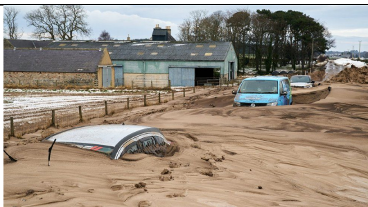
Mud, not muddy water!

If you have something that helps your mobility why not let us know about it. To share your experience, email me at homer@thelindsays.info